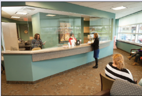
Lobby and registration area of Breast Care of WNY's offices in Williamsville, NY.

In 2013, Breast Care of WNY opened a new office at 199 Park Club Lane in Williamsville as part of a multi-specialty center, offering mammography, biopsies, MRIs, radiation therapy, chemotherapy, genetic testing and minor surgical procedures that do not require sedation.