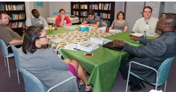
Typical CPE group meeting.

A unit of CPE consists of 400 supervised hours. At least 100 hours are spent in the group process, and at least 300 hours are spent in direct ministry to persons. Several hours a week are required to complete outside assignments.