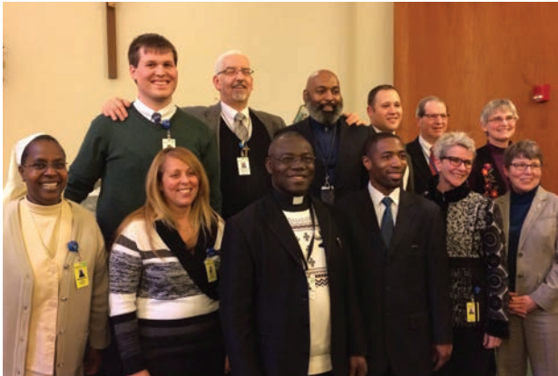
Graduation of CPE Group.

"Our hand prints don't fade from the lives we touch."