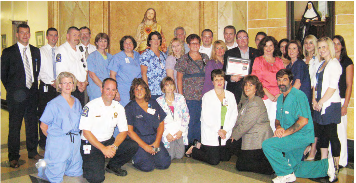
Mercy Hospital received National Quality Achievement Awards for STEMI heart attack care and stroke care by the American Heart Association and American Stroke Association's Mission: Lifeline® Get With The Guidelines® program. In above photo, the Heart Center team and local EMS professionals recently gathered for the AHA award presentation in the hospital's rotunda.