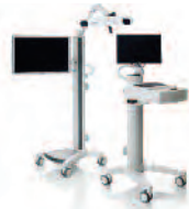
RIO™ Robotic Arm Interactive Orthopedic System