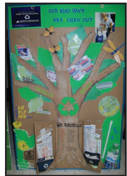
This poster was created by Ambulatory Surgery.

Ambulatory Surgery took first prize, followed by Administration/Medical Staff, and 3 East.