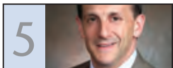
5 NCQA Recognizes Catholic Medical Partners For Disease Management