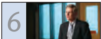
6 CPOE Implementation Continues