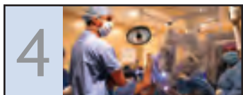
4 Catholic Health Plays Host To Innovative Procedure