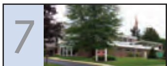
7 Collaboration Opens Healthcare Options in the Southtowns