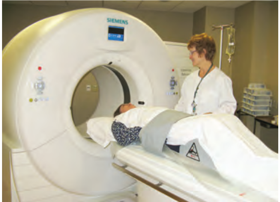
Catholic Health has invested $11.5 million in imaging technology to provide physicians with some of the most advanced diagnostic tools available.

The new MRI system features a large bore opening and short core depth that offers a more comfortable experi-