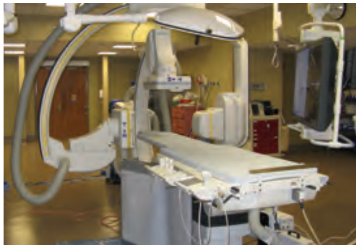
Mercy Hospital is home to the region's first hybrid OR featuring a new biplane imaging system.