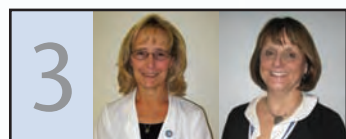
Key Positions Support Quality in Cardiac and Women's Service Lines