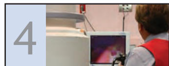
Direct Peroral Cholangioscopy