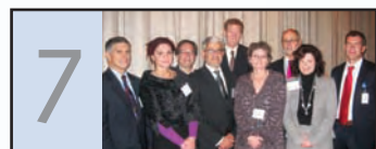
Catholic Health Cardiovascular Symposium

The healthcare landscape is shifting quickly and dramatically. From healthcare reform to technology, the practice of medicine is being shaped by outside influences like never before. For many physicians in private practice, either as solo practitioners or in small groups, these outside influences are becoming an overwhelming burden and detracting from what they really love to do – treat patients.