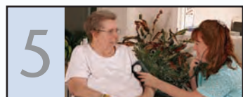
Celebrating a Year of LIFE