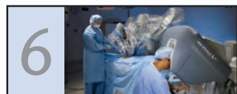
Catholic Health Leads the Region in Robotic-Assisted Surgery