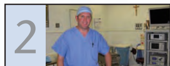
Advancements Continue in Single Incision Laparoscopy